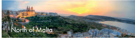
North of Malta