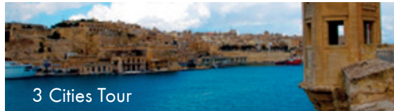
3 Cities Tour